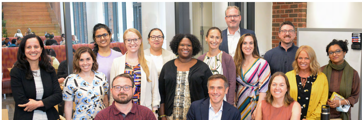
Alongside faculty members, dozens of staff members, including this group convened in 2022, have contributed to research and curriculum work since 2019.

To bring research findings back to the people and places where the research questions originated, and to disseminate learnings broadly to those who can leverage them in their work, we have produced practitioner-oriented articles. These Action Insights make the findings and insights from our academic research accessible to practitioners and students. Appendix C provides a list (with links) of the Initiative's practitioner-oriented publications.