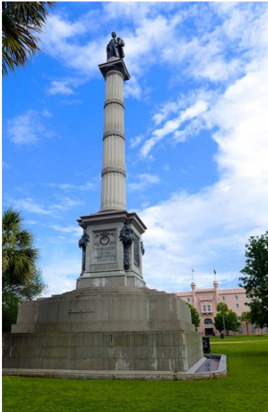
Photo by Andy Hunter. Source: https://www.scpictureproject.org/wp-content/uploads/calhoun-monument.jpg . Used with permission.